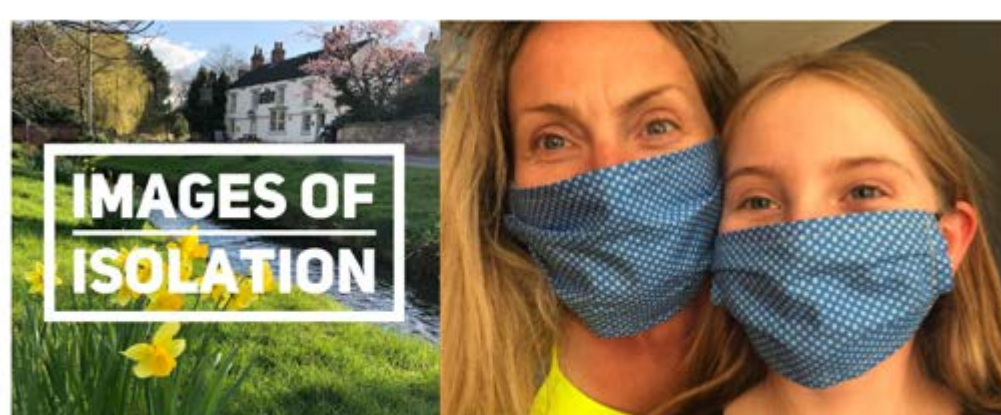
Photo exhibition records North Yorkshire village life during Covid - BBC News

A Record and Reflection of Bishop Monkton and its Residents during the Covid Pandemic These pictures, verses, reflections and videos were displayed and shown in the Village Hall over the 2021 August Bank Holiday weekend